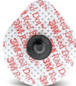
3M Red Dot Soft Cloth Monitoring Electrode 2268-3 3.2cm dia. Conductive adhesive for Pediatric and Adult use