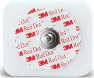
3M™ Red Dot™ Monitoring Electrode with Foam Tape and Sticky Gel 2560 4cm × 3.5cm Diaphoretic