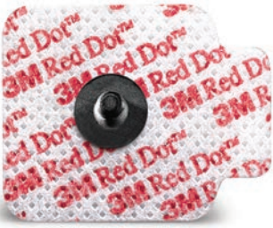
3M™ Red Dot™ Repositionable Monitoring Electrode 2660 4cm × 3.2cm Radiolucent