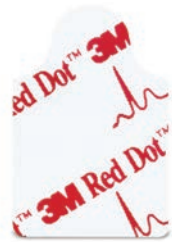
3M™ Red Dot™ Resting ECG Electrode 2330 2cm × 3cm Radiolucent, gentle adhesive