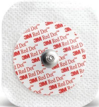
3M Red Dot Diaphoretic Soft Cloth Monitoring Electrode 2231 5.1cm x 5.5cm, Solid gel