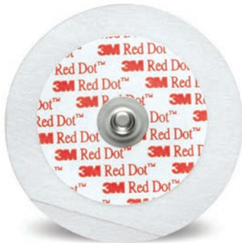
3M™ Red Dot™ Pediatric Monitoring Electrode with 3M™ Micropore™ Tape Backing 2248-50 4.4cm dia. Solid gel