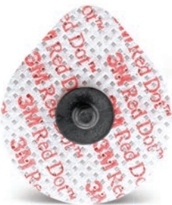
3M™ Red Dot™ ECG Monitoring Electrode 2268-3 3.2cm dia. Conductive adhesive, soft cloth for Pediatric and Adult use