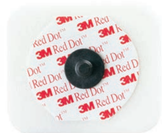
3M Red Dot Monitoring Electrode with Foam Tape and Sticky Gel 2570 4cm x 3.5cm Radiolucent with abradant