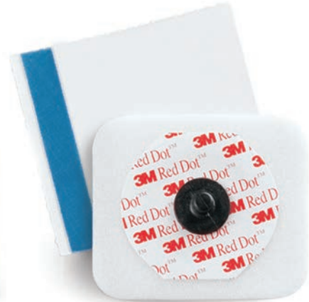
3M™ Red Dot™ Monitoring Electrode with Foam Tape and Sticky Gel 2570 4cm × 3.5cm Diaphoretic, radiolucent, with abrader