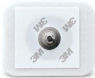
3M™ Foam Monitoring Electrode 2228 4cm × 3.3cm Diaphoretic, sticky gel