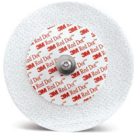
3M Red Dot Soft Cloth Monitoring Electrode 2238 6cm dia., Solid gel