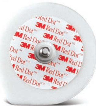
3M Red Dot Foam Monitoring Electrode 2237 4.4cm dia., Solid gel