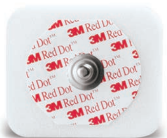
3M Red Dot Foam Monitoring Electrode 2560 4cm x 3.5cm with sticky gel