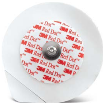
3M Red Dot Clear Plastic Monitoring Electrode 2235 4.4cm dia., Solid gel