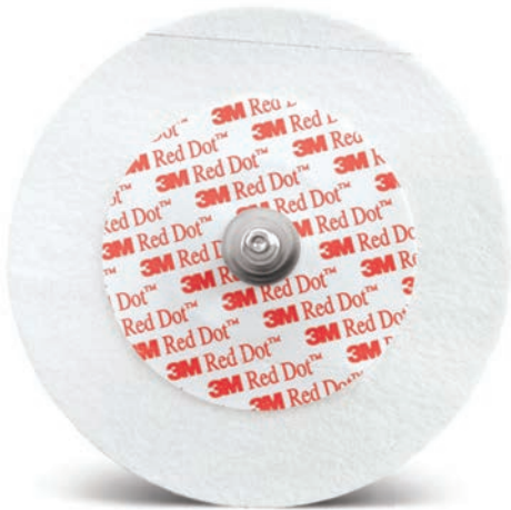
3M Red Dot Monitoring Electrode with 3M Micropore Tape Backing 2239 6cm dia., Solid gel