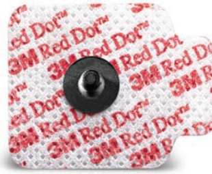
3M™ Red Dot™ Repositionable Monitoring Electrode 2670 4cm × 3.2cm Radiolucent, stronger adhesive than 2660