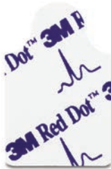
3M™ Red Dot™ Resting ECG Electrode 2360 2cm × 3cm Radiolucent, repositionable, stronger adhesive than 2330