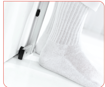
The foot positioner ensures exact positioning and precise measurements.

The telescoping function ensures that readings are always at eye level, for accurate readings regardless of the angle from which one looks. The seca 222 comes with an attachable headpiece for accurate head adjustment. When not in use, the measuring slide can be folded down for safety.