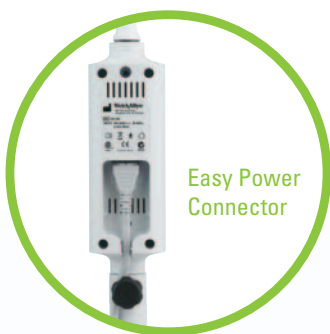
Easy Power Connector