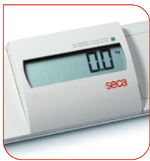
The patient's BMI can be determined when his height is entered.

The low platform profile reduces patient effort and risk when stepping on the scale. As the 22 x 22 inch platform is almost twice as large as that of a normal scale, a chair may also be placed on the scale for weighing a patient. With the pre-TARE function, the weight of a chair or standing aid can simply be tared away. Up to 3 TARE weights (e.g. chair weights) can be stored.