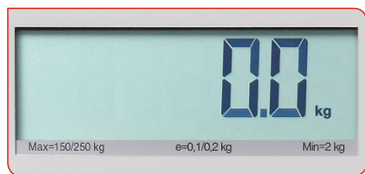
Large display for easy reading.