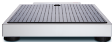
Flat construction and slip-proof surface for a comfortable foothold.

The scale is easy to operate even with the display and operating elements integrated in the base. Just a light tap of the toe on the scale surface turns on the scale. Infants and small children can be easily weighed while being held by the mother. All she has to do is weigh herself separately first. Then the mother/child-function ascertains the tare of the weight.