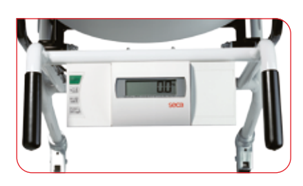
The practical positioning of the display allows easy operation.