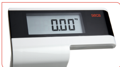
The display on a high column is easy to read.

What is simpler than the Step-off function? Simply stand on the scale without switching it on, wait for "Step-off" on the display, then Step off at leisure and read off the measurements. This is ideal particularly for pregnant women and people of larger girth. You see, a scale from seca is on the ball. It's just one of the reasons why seca has been the global market leader in the field of medical weighing and measuring for many years.